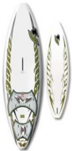
Spice 86 Spice 96