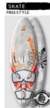
Skate 99 Skate 100 Skate 102 Skate 107 Skate 110 Skate 112