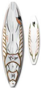
Chilli 99 Chilli 107