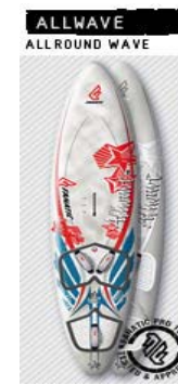
AllWave 72 AllWave 82 AllWave 86