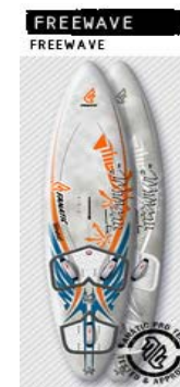
FreeWave 85 FreeWave 95 FreeWave 104 FreeWave 105 FreeWave 115