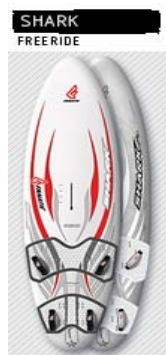
Shark 115 Shark 125 Shark 130 Shark 135 Shark 145 Shark 150 Shark 160