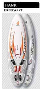
Hawk 95 Hawk 100 Hawk 110 Hawk 120 Hawk 123