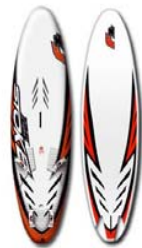
Stoke 105 Stoke 115 Stoke 117 Stoke 127 Stoke 135 Stoke 145 Stoke 155