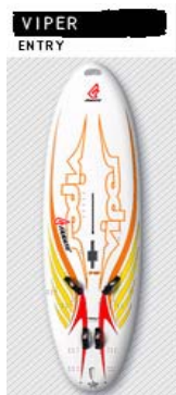
Viper 85 Viper 80