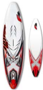
Eliminator 103 Eliminator 115