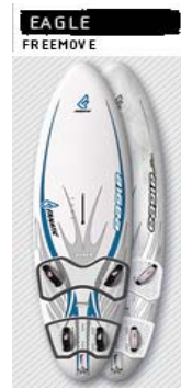
Eagle 113 Eagle 126